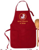
#2 Athena w/Owl in Red "Greek Goddess at Work"