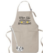
#5 When Life gives you Lemons make Avgolemono in Khaki