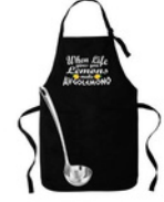
#6 When Life gives you Lemons make Avgolemono in Black