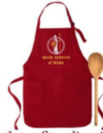
#1 Athena Standing in Red "Greek Goddess at Work"

Each Apron is Embroidered Shipping can be arranged for an additional charge.