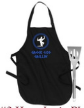
#3 Hercules in Black "Greek God Grillin"