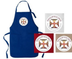
#4 Philoptochos Cross in (a)Red (b)White (c)Blue (d)Khaki