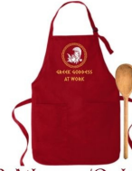
#2 Athena w/Owl in Red "Greek Goddess at Work"