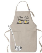
#5 When Life gives you Lemons make Avgolemono in Khaki