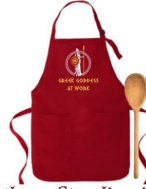
#1 Athena Standing in Red "Greek Goddess at Work"

Each Apron is Embroidered Shipping can be arranged for an additional charge.