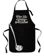
#6 When Life gives you Lemons make Avgolemono in Black