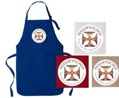
#4 Philoptochos Cross in (a)Red (b)White (c)Blue (d)Khaki