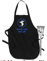
#3 Hercules in Black "Greek God Grillin"