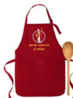
#1 Athena Standing in Red "Greek Goddess at Work"

Shipping can be arranged for an additional charge.