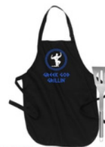
#3 Hercules in Black "Greek God Grillin"