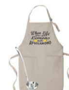
#5 When Life gives you Lemons make Avgolemono in Khaki