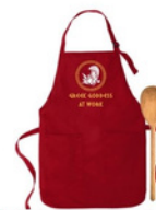
#2 Athena w/Owl in Red "Greek Goddess at Work"