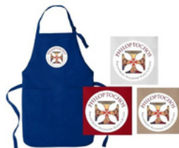
#4 Philoptochos Cross in (a)Red (b)White (c)Blue (d)Khaki