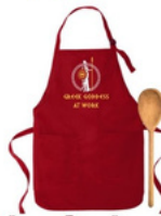
#1 Athena Standing in Red "Greek Goddess at Work"

Each Apron is Embroidered Shipping can be arranged for an additional charge.