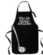
#6 When Life gives you Lemons make Avgolemono in Black