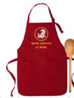
#2 Athena w/Owl in Red "Greek Goddess at Work"