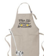
#5 When Life gives you Lemons make Avgolemono in Khaki