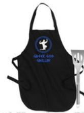
#3 Hercules in Black "Greek God Grillin"