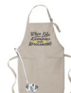
#5 When Life gives you Lemons make Avgolemono in Khaki