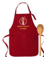
#1 Athena Standing in Red "Greek Goddess at Work"

Each Apron is Embroidered Shipping can be arranged for an additional charge.