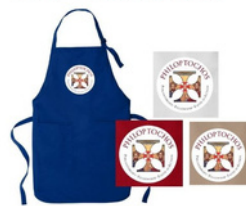
#4 Philoptochos Cross in (a)Red (b)White (c)Blue (d)Khaki