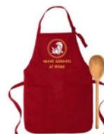
#2 Athena w/Owl in Red "Greek Goddess at Work"