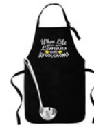
#6 When Life gives you Lemons make Avgolemono in Black