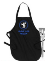
#3 Hercules in Black "Greek God Grillin"