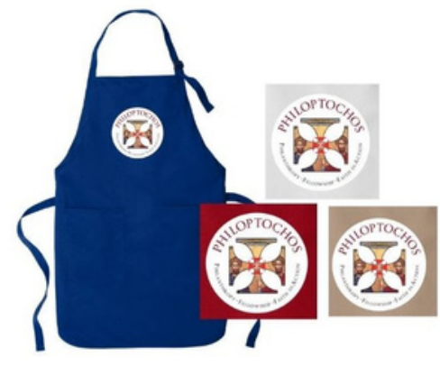
#4 Philoptochos Cross in (a)Red (b)White (c)Blue (d)Khaki