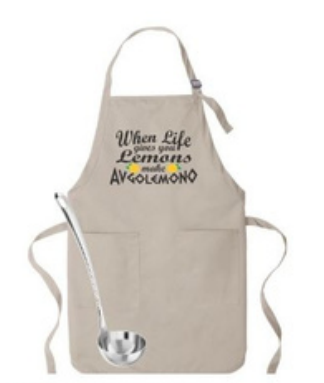
#5 When Life gives you Lemons make Avgolemono in Khaki