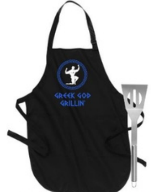
#3 Hercules in Black "Greek God Grillin"

#2 Athena w/Owl in Red "Greek Goddess at Work"