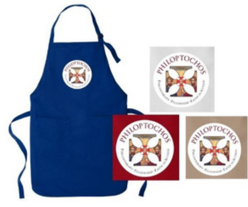
#4 Philoptochos Cross in (a)Red (b)White (c)Blue (d)Khaki