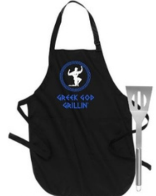
#3 Hercules in Black "Greek God Grillin"

#2 Athena w/Owl in Red "Greek Goddess at Work"