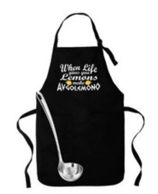
#6 When Life gives you Lemons make Avgolemono in Black