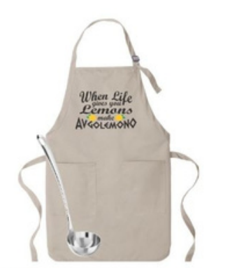
#5 When Life gives you Lemons make Avgolemono in Khaki