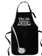
#6 When Life gives you Lemons make Avgolemono in Black