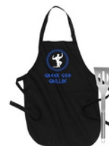
#3 Hercules in Black "Greek God Grillin"