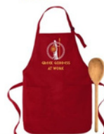
#1 Athena Standing in Red "Greek Goddess at Work"

Each Apron is Embroidered Shipping can be arranged for an additional charge.