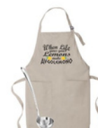
#5 When Life gives you Lemons make Avgolemono in Khaki