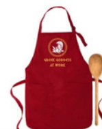
#2 Athena w/Owl in Red "Greek Goddess at Work"