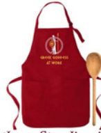
#1 Athena Standing in Red "Greek Goddess at Work"

Each Apron is Embroidered Shipping can be arranged for an additional charge.