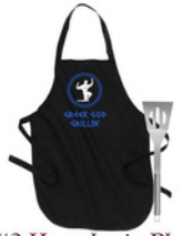
#3 Hercules in Black "Greek God Grillin"