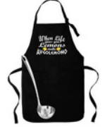
#6 When Life gives you Lemons make Avgolemono in Black