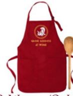
#2 Athena w/Owl in Red "Greek Goddess at Work"