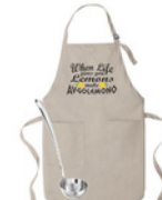
#5 When Life gives you Lemons make Avgolemono in Khaki