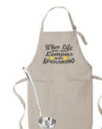
#5 When Life gives you Lemons make Avgolemono in Khaki