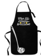
#6 When Life gives you Lemons make Avgolemono in Black