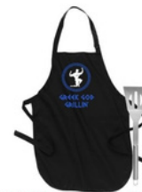
#3 Hercules in Black "Greek God Grillin"