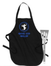
#3 Hercules in Black "Greek God Grillin"