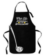
#6 When Life gives you Lemons make Avgolemono in Black