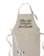
#5 When Life gives you Lemons make Avgolemono in Khaki