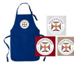
#4 Philoptochos Cross in (a)Red (b)White (c)Blue (d)Khaki