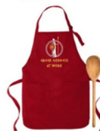
#1 Athena Standing in Red "Greek Goddess at Work"

Shipping can be arranged for an additional charge.