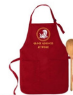
#2 Athena w/Owl in Red "Greek Goddess at Work"