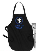
#3 Hercules in Black "Greek God Grillin"