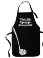
#6 When Life gives you Lemons make Avgolemono in Black