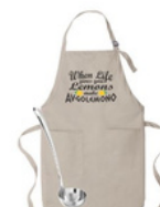
#5 When Life gives you Lemons make Avgolemono in Khaki