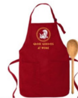
#2 Athena w/Owl in Red "Greek Goddess at Work"