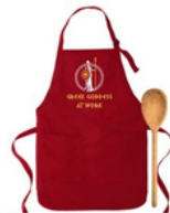
#1 Athena Standing in Red "Greek Goddess at Work"

Shipping can be arranged for an additional charge.