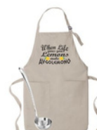
#5 When Life gives you Lemons make Avgolemono in Khaki