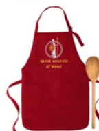
#1 Athena Standing in Red "Greek Goddess at Work"

Each Apron is Embroidered Shipping can be arranged for an additional charge.