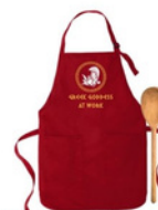
#2 Athena w/Owl in Red "Greek Goddess at Work"