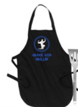
#3 Hercules in Black "Greek God Grillin"