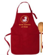
#2 Athena w/Owl in Red "Greek Goddess at Work"