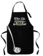
#6 When Life gives you Lemons make Avgolemono in Black