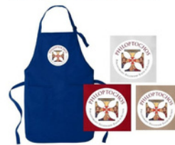
#4 Philoptochos Cross in (a)Red (b)White (c)Blue (d)Khaki