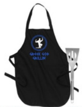
#3 Hercules in Black "Greek God Grillin"