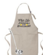
#5 When Life gives you Lemons make Avgolemono in Khaki