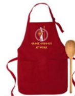
#1 Athena Standing in Red "Greek Goddess at Work"

Each Apron is Embroidered Shipping can be arranged for an additional charge.