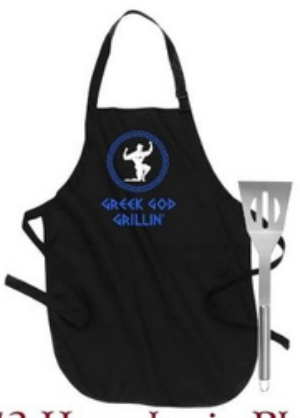
#3 Hercules in Black "Greek God Grillin"