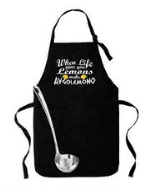
#6 When Life gives you Lemons make Avgolemono in Black