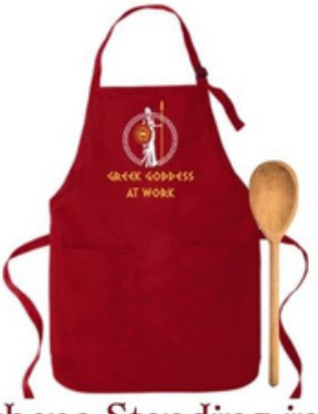
#1 Athena Standing in Red "Greek Goddess at Work"

Shipping can be arranged for an additional charge.