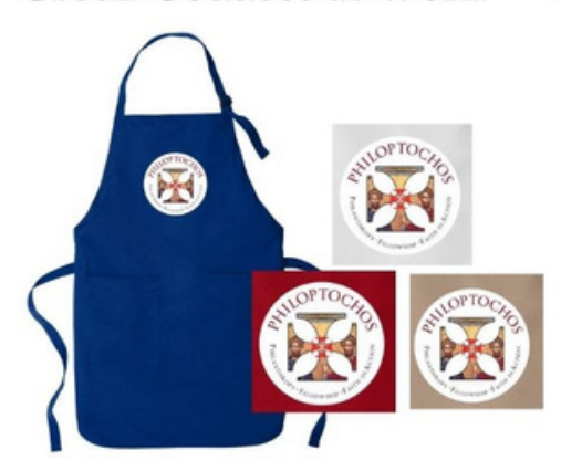
#4 Philoptochos Cross in (a)Red (b)White (c)Blue (d)Khaki