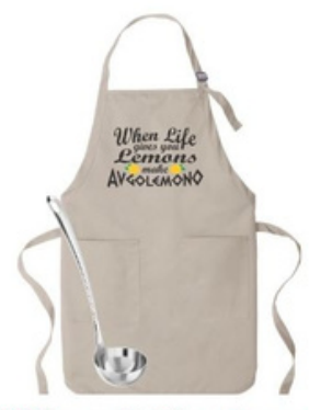
#5 When Life gives you Lemons make Avgolemono in Khaki