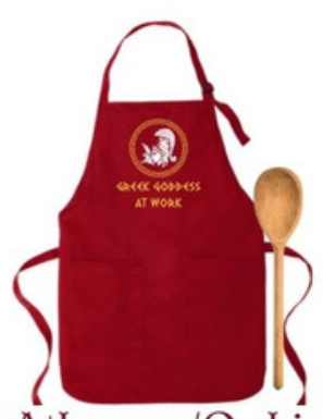
#2 Athena w/Owl in Red "Greek Goddess at Work"