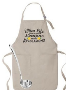
#5 When Life gives you Lemons make Avgolemono in Khaki