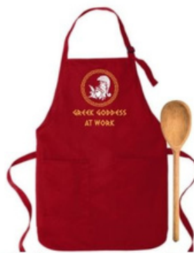
#2 Athena w/Owl in Red "Greek Goddess at Work"