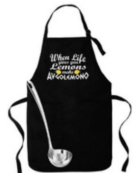
#6 When Life gives you Lemons make Avgolemono in Black