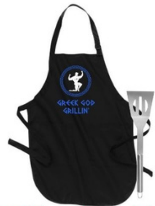
#3 Hercules in Black "Greek God Grillin"