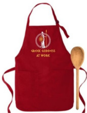
#1 Athena Standing in Red "Greek Goddess at Work"

Each Apron is Embroidered Shipping can be arranged for an additional charge.