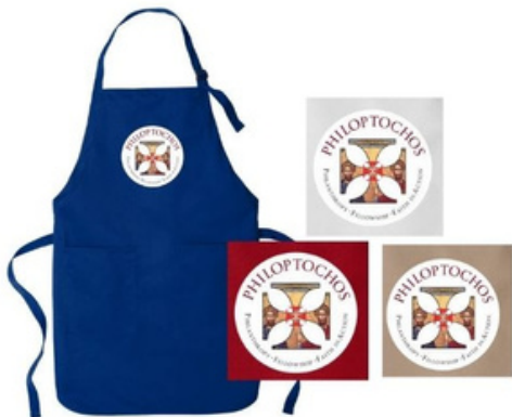
#4 Philoptochos Cross in (a)Red (b)White (c)Blue (d)Khaki